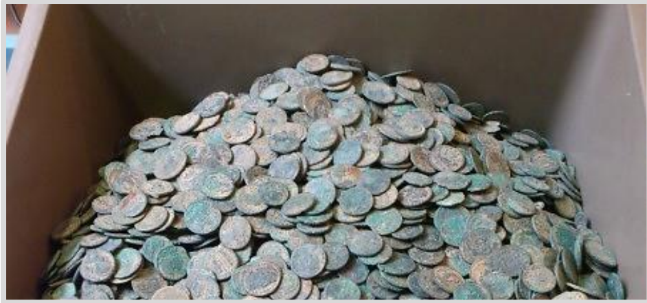
The Seaton Down Hoard